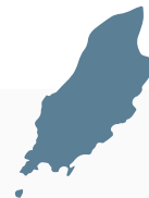
ISLE OF MAN

Home to some of the world's leading banks, financial institutions and law firms delivering first-class services with easy reach is a specialised centre that provides extensive private client, corporate and fund administration services.